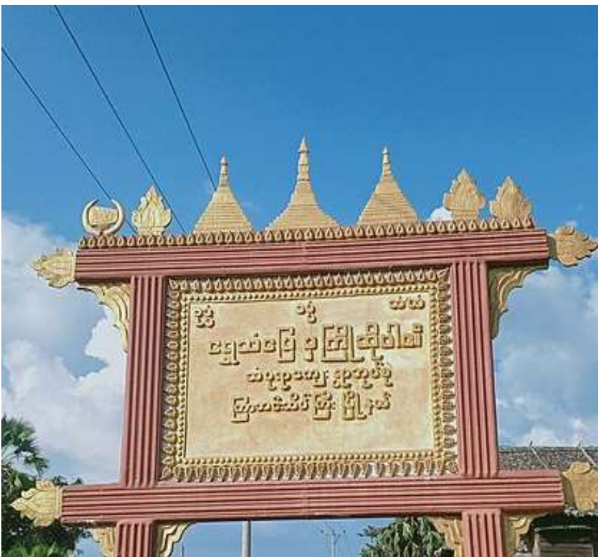
September 26, 2022

HURFOM: On August 22, 2022, a transformer in Kyarinnseiky Township, Karen State was damaged by a bomb blast, leaving many villages in the township without power for the past month.