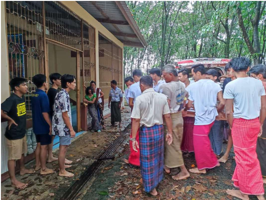
August 3, 2022

HURFOM: According to local sources, police and security forces from the Lamine Police Station, in Ye Township, Mon State shot and killed a young social worker at approximately 11 pm on July 31, 2022.