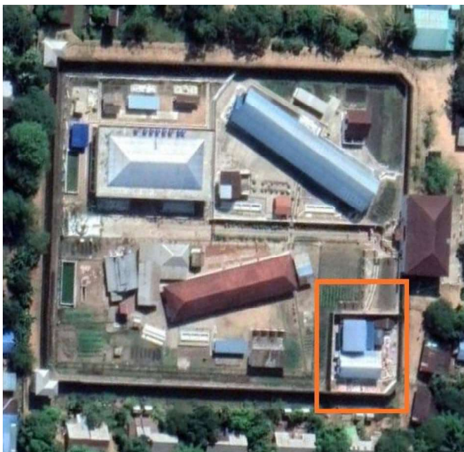
August 4, 2022

HURFOM: Female prisoners in the Dawei Prison located in Dawei City, Tenasserim Division are in urgent need of personal hygiene products and health care services. The Dawei Prison has more than 100 female prisoners and 40 of them are political prisoners.