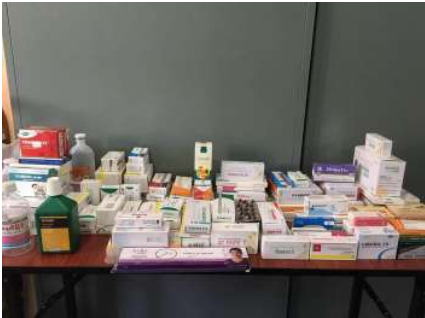
September 24, 2022

HURFOM: Some medicines have been out of stock since September in Mon state. Patients are paying unusually high prices for needed medications.